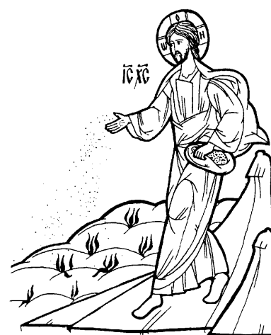
·THE SOWER OF GOOD SEEDS·

Christ’s death and resurrection were public events precisely because they were to become publically proclaimed. We cannot separate the personal Christ from His resurrection – and we cannot separate our faith in and experience of the risen Christ from our calling to proclaim His resurrection “to the end of the earth”. Faith in the risen Christ is reduced to an intellectual exercise if we fail to share it with those yet to discover and experience it. The Good News is not “our little secret.” If one actually has a personal experience of the beauty and goodness of God she will want to share it.